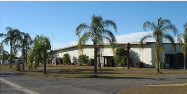
Huge recreation hall containing auditorium, meeting rooms, kitchen, library, restrooms, exercise room and locker rooms.