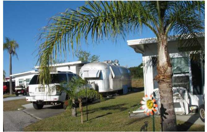
Some of these trailers haven't moved in years. . .

Owing to tax and zoning laws and condo association rules, all 314 lots are very similar. In addition to a full-hookup RV pad, most include an 8'x10' “shed” and a 10'x20' “cabana”, or “Florida room”. Both are usually well furnished. The shed in the space we are renting contains a toilet, sink, and full-sized shower stall, large refrigerator, over/under washer-dryer, and even some storage! At any given time 20 or 30 spaces are available for rent. Spaces available for rent and for sale are listed on the park web site, www.pcca.us