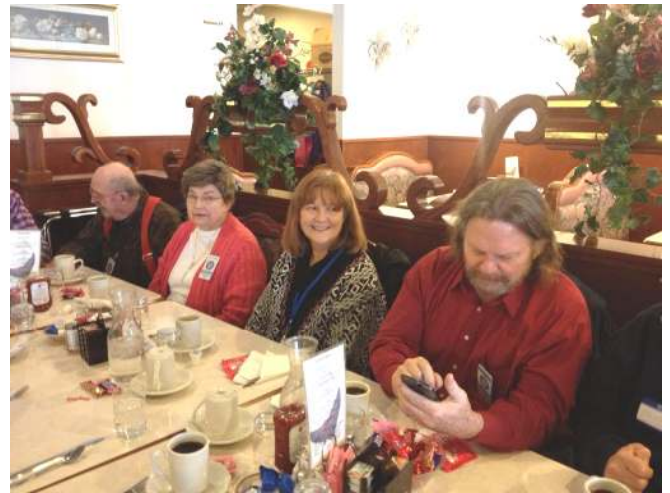
Somebody is always texting nowadays. . . !