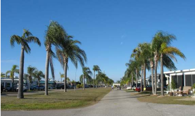
Paradise Park Boulevard seen from the park entrance.

This year Barb and I are doing the “snowbird” thing at Paradise Park, one of several Airstream parks in Florida. Paradise Park is a condominium—all spaces are privately owned, together with their share of the common facilities—which, as in most Airstream parks, are extensive!