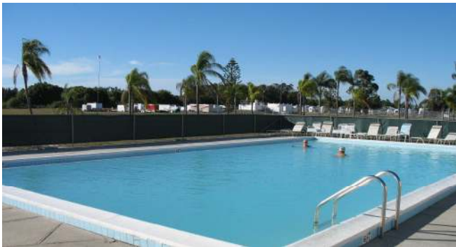
Outdoor pool (only occasionally visited by alligators).

The main park attraction is the golf course, but there are also two lakes, shuffleboard, bocci ball & basketball courts, etc.