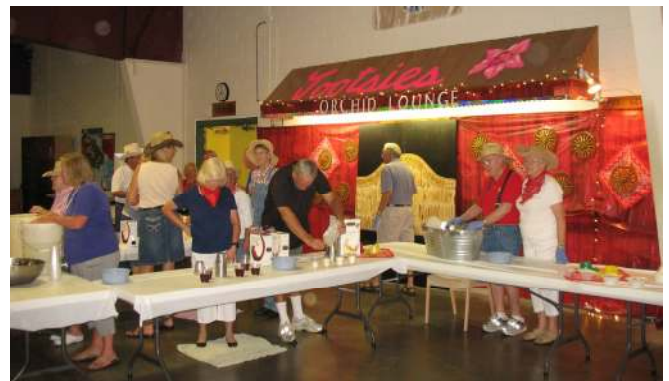
Rec hall tricked out as “Nashville Saloon” for Festival.

The folks at Paradise Park are friendly, and will party at the drop of a hat. We happened to be here for Festival Week, essentially celebratng that they don't have winter here!