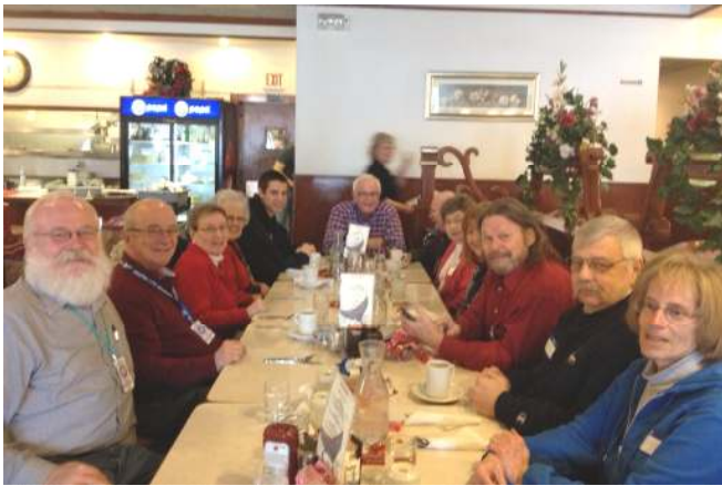
Neither snow, nor rain, nor dark of night will stay these Airstreamers from their unit activities!