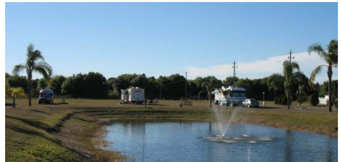
Small lake, with 24 full-hookup visitor spaces at one end.

The folks at Paradise Park are friendly, and will party at the drop of a hat. We happened to be here for Festival Week, essentially celebratng that they don't have winter here!