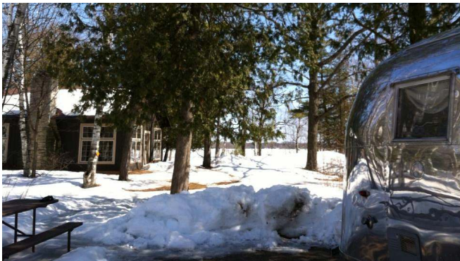
A little chilly, maybe, but, we're camped!

But Don & Kay Stenz, in particular, weren't going to give it up if they could help it. In keeping with the spirit of the season, they were able to "resurrect" the campout at Potawatomi State Park.