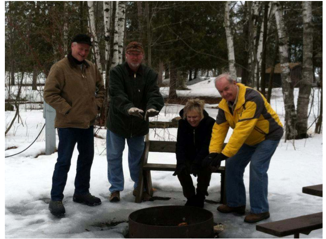
Could use a little more fire. . .

The attendees also upheld the reputation of the Wisconsin Unit. When the Stenzes showed up, the ranger at the gate asked, "Are you camping with those loonies back there?!"