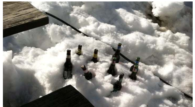
. . . you don't need any ice for the cooler. In fact. . . you don't even need a cooler!

There are a few compensations for winter camping. . .