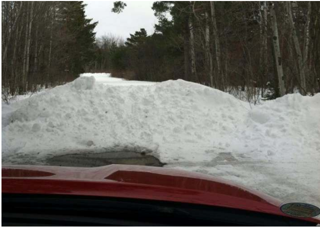
Road to campground blocked by snow!

One week before Easter the road to the Peninsula State Park campground looked like this. Ed & Sandy decided they would have to cancel the campout, a tradition of 15 years.