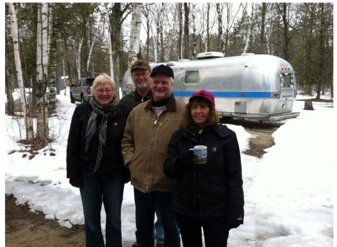
Hardy Airstreamers pose for a group picture.

The attendees also upheld the reputation of the Wisconsin Unit. When the Stenzes showed up, the ranger at the gate asked, "Are you camping with those loonies back there?!"