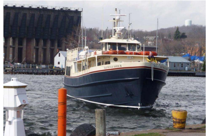
Marquette harbor cruise on the Isle Royale Queen III