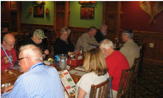
Deliberating over the extensive menu.