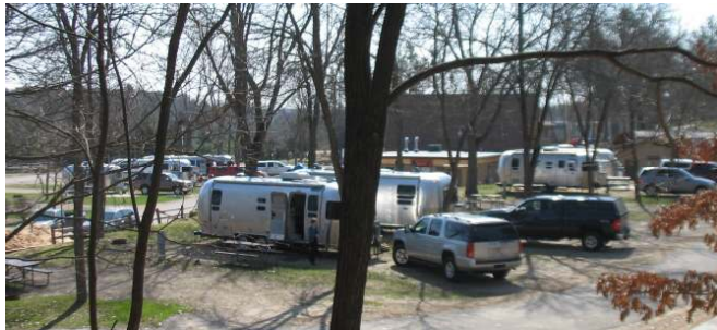
Airstreams up and Airstreams down.

As always, Wisconsin Airstreamers, glad to welcome spring, turned out in good numbers, except for some unfortunate ones like those in the Upper Peninsula of Michigan, whose trailers were still buried in snow!