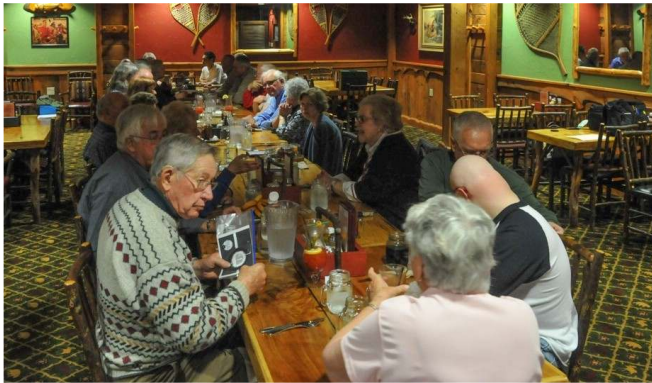
Instead of the long, long trailer it's the long, long table!

Being close to the population centers of Wisconsin, the April luncheon always draws a good crowd.