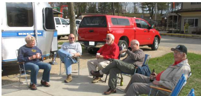
Hard to believe spring is finally here.

After soaking up our fill of sun (for one afternoon) the attendees went over to the nearby Trapper's Turn Country Club for their Friday night fish fry and a good fill of fish.