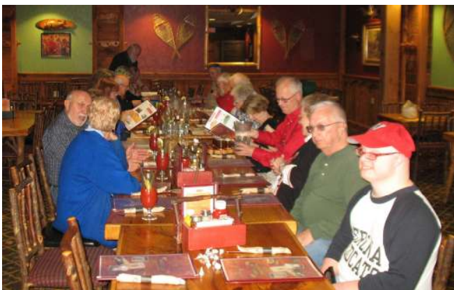
The Bloody Mary seems to be the drink of choice this year.

This was also the site of the spring business meeting, the results of which are reported elsewhere.