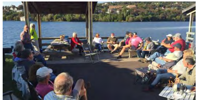
Happy hour on the shore of Portage Lake

The tour ran all morning, and by the time we got back the park was really beginning to fill up. Our bunch went into a long happy hour with dinner provided. The waterfront pavilions of the park were so full that it was hard to find a level spot to put a chair!