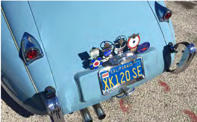
Well-badged Jaguar XK-120

The featured “badge” or manufacturer this year was Jaguar, and if you think the E Type of the sixties and seventies is one of the most beautiful cars ever produced you missed what had to be one of the largest assemblies of the type in the country.