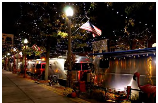
Looks pretty spectacular!