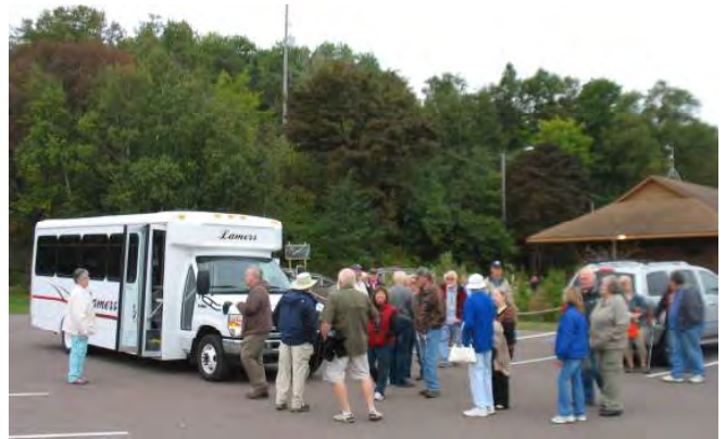
Boarding the bus for the Calumet tour

Sandy had scheduled a bus tour of the Calumet copper mining area for Friday morning. The guide was a local historian who was also a great storyteller!