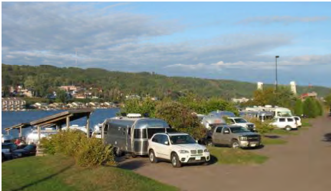
Both upper and lower levels full!