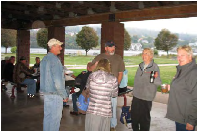
Breakfast at the pavilion on a foggy morning

Immediately after the conclusion of the business meeting and collecting some dues we all piled into our vehicles for a tour of the Keweenaw Peninsula guided by Ed & Sandy. Some stopped at Fitzgerald's in Eagle River for lunch or a beer, and everybody stopped at the Jam Pot for jam and baked goods. Operated by monks of the Society of Saint John, it's located out in the middle of trackless nowhere on the Lake Superior shore. The parking lot is always full and there is always a line at the cash register!