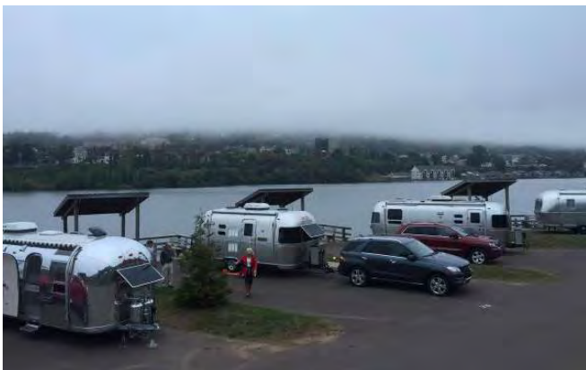
Morning fog hanging low over Portage Lake

Weather for the rally was good, typically with fog in the morning but clearing to cool and sunny in the afternoons.