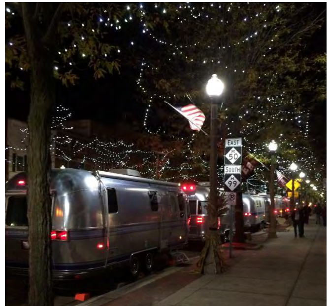
Here's what it looks like at night!