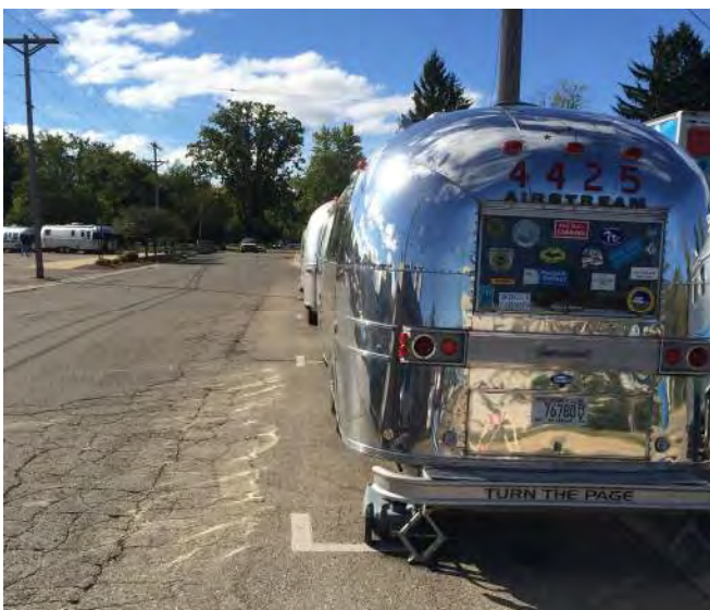
Emericks' shiny Airstream—seen in daylight.