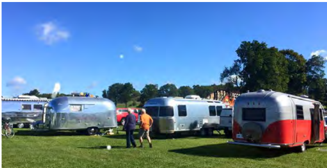
Lots of Airstreams (and an Avion or two)

The remainder of the afternoon saw the arrival of the rest of the gathering who were all set up in time for happy hour. The evening meal was on our own with some dining in at their unit in the campground, some taking in a fish fry at a local restaurant, and others driving south to Plymouth to take in a local festival. As forecast, the rain and wind Friday night into the early hours of Saturday morning had us all thankful we were sleeping in Jackson Center's finest.