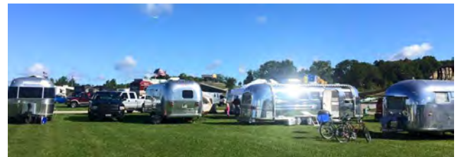
Emericks' Airstream dazzles onlookers in the afternoon sun.

The Saturday happy hour evolved into a cook out with BYO meat to grill and a dish to share. A campfire was lit and the evening was spent visiting around the campfire or going over to watch the kart racing under the lights.