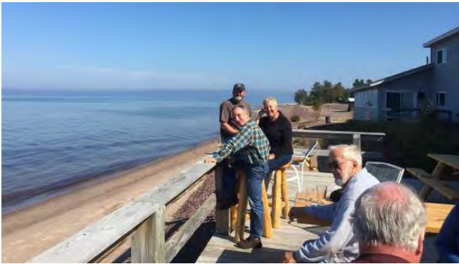
On the beach at Fitzgerald's