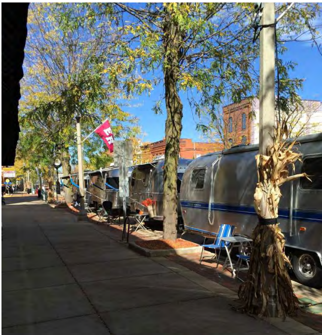
Airstreams parked right on the street—ready to party!

Several Wisconsin Unit members attended the annual Urban Air rally in Eaton Rapids, Michigan. The city of Eaton Rapids hosts an Airstream rally on its city streets, with food, entertainment, and partying. (Eaton Rapids, population 5,214 as of the 2010 census, isn't really too urban!).