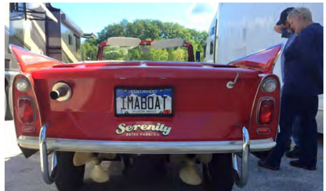
This one's also a boat!