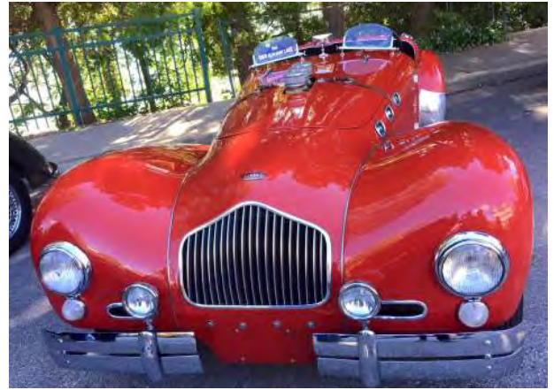
Cars, cars, and more cars!